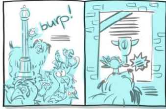
Page 8 And anywhere else people can hear his wonderfulness. Page 9 Canary Hall Presents Best Singer in the World Contest! First Prize: a Really Big Trophy! Everyone Welcome, Even Dogs! He couldn't resist entering.