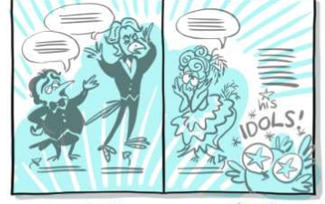
Page 12 "What's that terrible sound?" "It's horrible." "My ears are going to explode!" Page 13 But then, Chirpy Burpy cannot believe what he sees. The three contestants are none other than... Luciano Twestarotti, Andrea Birdacelli, and Beverly Bills. His Idols! name tags