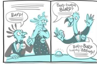
Page 26 At last, the judges weigh in. Who's it going to be? "Burp!" Translation: He's magnificent! Page 27 "Burp-Burp-Burp." Translation: Chirpy Burpy is the Best Singer in the World.