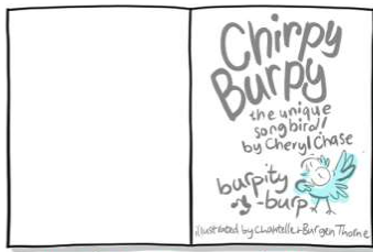
Inside front cover Page 1 Half title Chirpy Burpy By Cheryl Chase illustrated by Chantelle & Burgen Thorne