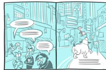
Page 30 "Who wants poop pudding pops anyway?" "What a joke...HEY... did you just burp?" "Excuse me. How did I sound?" Page 31 Chirpy Burpy is so happy that he and Waldo dance all the way home.