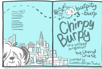
Page 2 Imprint Imprint, copyright and publishing details Page 3 Full title Chirpy Burpy By Cheryl Chase illustrated by Chantelle & Burgen Thorne