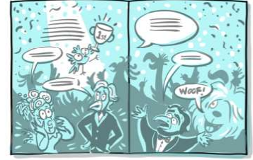
Page 28 "Are you kidding?" "I don't believe it." "Huh?" Page 29 Chirpy Burpy gets a really big trophy and a year supply of pudding pops. "I'm the best singer in the whole world!"