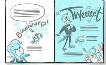
Page 20 "Hello, Mr. Birdacelli, Sir. Your singing is the tops. Hey, get a load of me. Bunuuuurp." Andrea Birdacelli glares at Chirpy Burpy. "Tweeeeeeeeeet." Page 21 Chirpy Burpy's tongue becomes dry. He hardly chirps a single note now. He clears his throat, then sprays it with eucalyptus water.