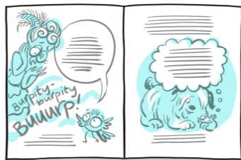
Page 22 "Hello, Ms. Bills. I think your voice is the bomb. Here, check me out. Burpily-Burpily-Bunuurp." Beverly Bills is too shocked to tweet a single note. Page 23 None of Chirpy Burpy's singing attempts make a good impression on his idols. "Oh, no! What if I'm not a good singer? What if I go on stage and I fail? What if people laugh at me?" Waldo nuzzles Chirpy Burpy to make him feel better. Chirpy Burpy decides to be himself.