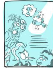
Back cover Chirpy Burpy is a songbird who loves wearing trophies and singing. But his singing is... unique. In fact, it sounds an awful lot like burping! When he enters a singing contest, his music dinks out and over at his unusual sound, but they learn a valuable lesson that beauty is in the ear of the beholder. A story of staying true to oneself. from award-winning voice actress Cheryl Chase ("Ragrats")