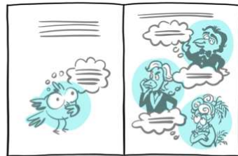
Page 14 They chirp and cheep for audiences everywhere. Can I beat these birds? Page 15 The contestants chuckle to themselves. "Who does he think he is?" "He's the worst." "What a knucklehead."