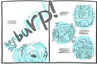
Page 6 He loves to sing. Page 7 He sings in the shower. In the subway. Even in the laundromat. include goldfish + plant - see original m/s at note