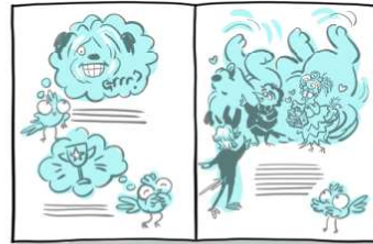
Page 16 Chirpy Burpy considers having Waldo scare everyone so they'd run away. Then, he'd for sure win the contest. But that's no way to think. Page 17 Waldo is a nice dog and he'd never scare anyone. Chirpy Burpy decides to be respectful to the contestants. They're his idols, after all.