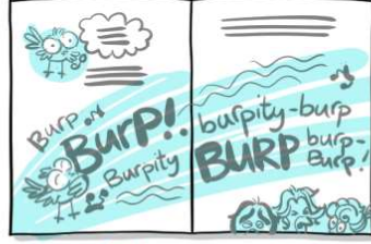
Page 10 Nobody here stands a chance against me! Chirpy Burpy puffs up his chest. Page 11 Burp-Burp-Burp-Burp-Burp-Burp-Burp. He rehearses his winning song.