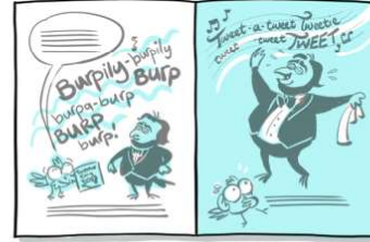
Page 18 "Hello, Mr. Twestarotti. I have all your records, and I can sing like you." "Burpily-Burpily-Burp-Burp-Burp-Burp." Page 19 Luciano Twestarotti blankly stares at Chirpy Burpy. "Tweet-A-Tweet-Tweet-Tweet-Tweet-Tweet." Sweet beads up on Chirpy Burpy's brow.